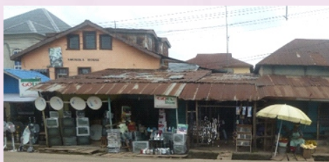
FRONT VIEW Awosika house as of 31 January 2018 before restoration

The Museum complex consists of (i) The Awosika Gallery, (ii) The Awosika Hall of Fame, (iii) Ekimogun Gallery and (iv) Chief Dr. Victor Oloyode Awosika Museum Exhibition Hall.