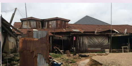
RIGHT-SIDE VIEW Awosika house as of 31 January 2018 before restoration